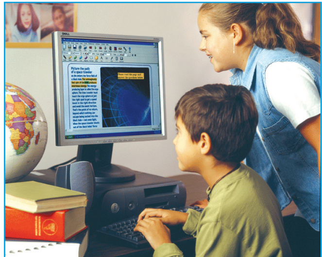
Students using Kurzweil 3000 in class.