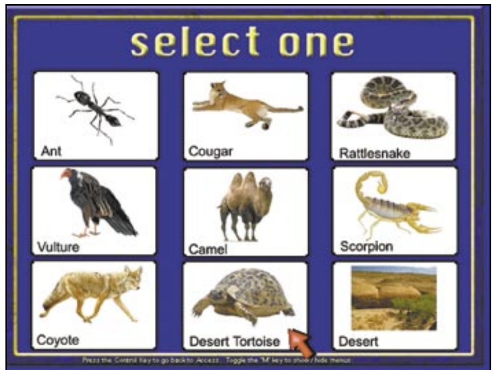
Switching On Science: Habitats (SoftTouch) is an excellent single switch program that helps integrate students with disabilities into standard curriculum areas.

LipSync Moving Sound Formation Cards (Educational Insights: 800-995-4436,