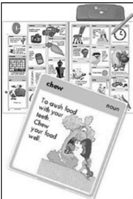
Big Brain Dictionary (Oregon Scientific) Touch the pictures with the pen and hear the name and definitions spoken aloud.

decorating cake houses; guiding oranges through the branches; rafting down the river while avoiding obstacles and picking up ingredients. Then they follow the recipes to make the cookies. There are three levels of difficulty and fun printable recipes are included. For Macintosh and Windows.