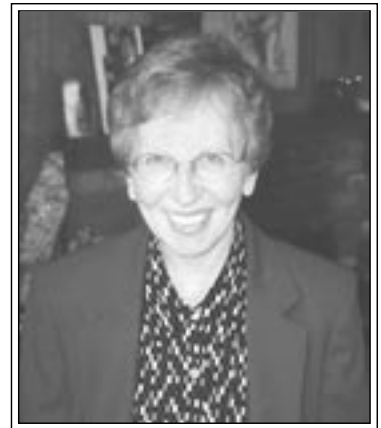
BY JOAN TANENHAUS COLUMNIST

be designed so they are either typed in or dragged from a list.); Customized vocabulary lists (Teachers can create lists that can be used with word prediction, or highlighted for reading.); Picture dictionary support (Kurzweil 3000 supports picture dictionary software – such as Mayer-Johnson Picture Communication Symbols and Crick Software. Students highlight a word they do not understand, click the picture icon on the toolbar, and the picture symbol for the word appears.); Reading the Web (Kurzweil will read the text on a Web site using all of the above speech, zoom, speed, magnifying tools); Send to e-mail feature (Students compose their e-mails in Kurzweil using all of the tools, then with a single command, send it to their e-mail application.); Saving documents as audio files (Kurzweil lets you save documents as either MP3 or WAV audio files that can be listened to on MP3 players and on iPods. In this way, teachers can prepare students' work that can be